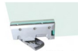
adjustable floor plate